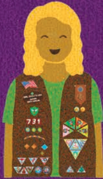
Brownies Grades 2-3