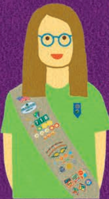
Seniors Grades 9-10