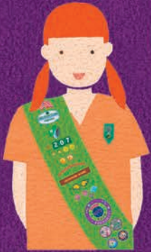
Juniors Grades 4-5