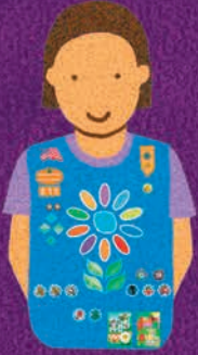
Daisies Grades K-1

Keep track as your girl levels up through the years!