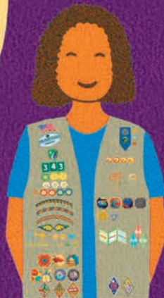
Ambassadors Grades 11-12