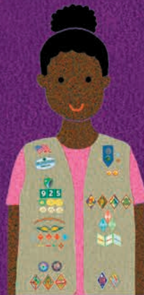
Cadettes Grades 6-8